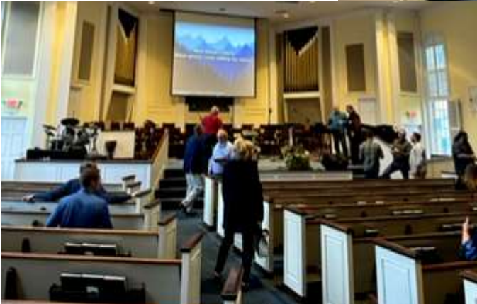
The meeting was held at Mt. Carmel Baptist where Cliff Myers serves as Transitional Pastor.