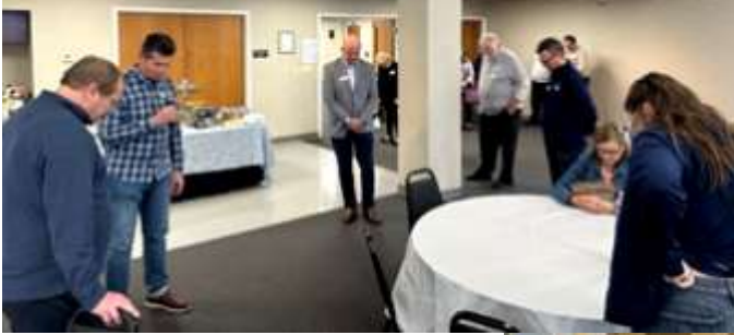
Food and fellowship was shared before the start of the meeting.